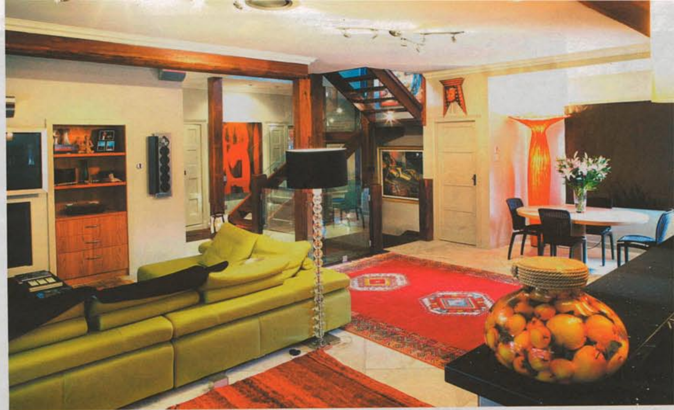
Warmth: the casual living room, above; the library, far right, has an ordered appearance; wooden balustrades were changed to glass, below