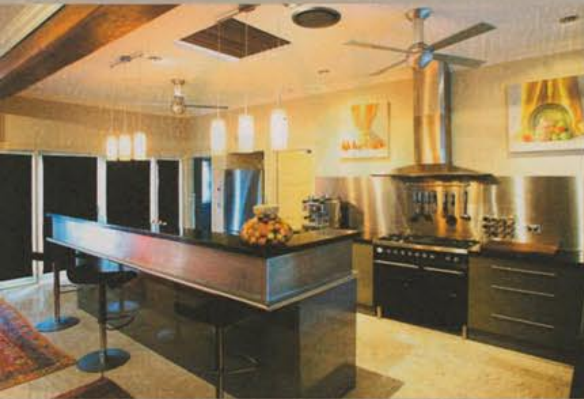
Gleaming: the kitchen was given a complete makeover