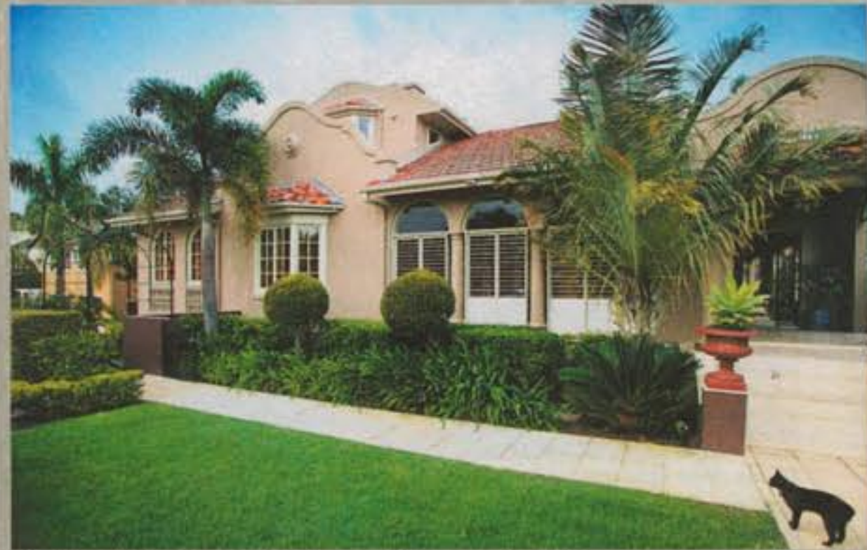
Neat: the Spanish mission-style home is surrounded by manicured gardens